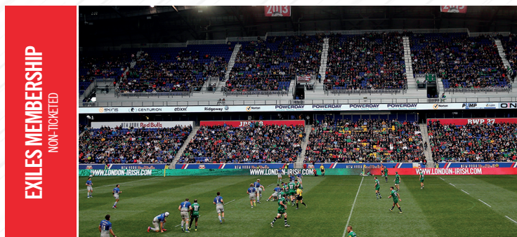
EXILES MEMBERSHIP NON-TICKETED