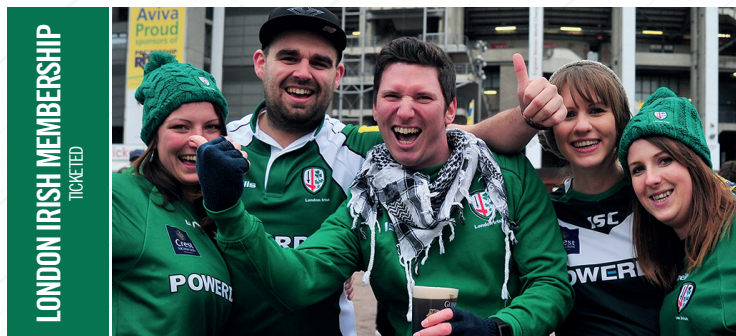
LONDON IRISH MEMBERSHIP TICKETED